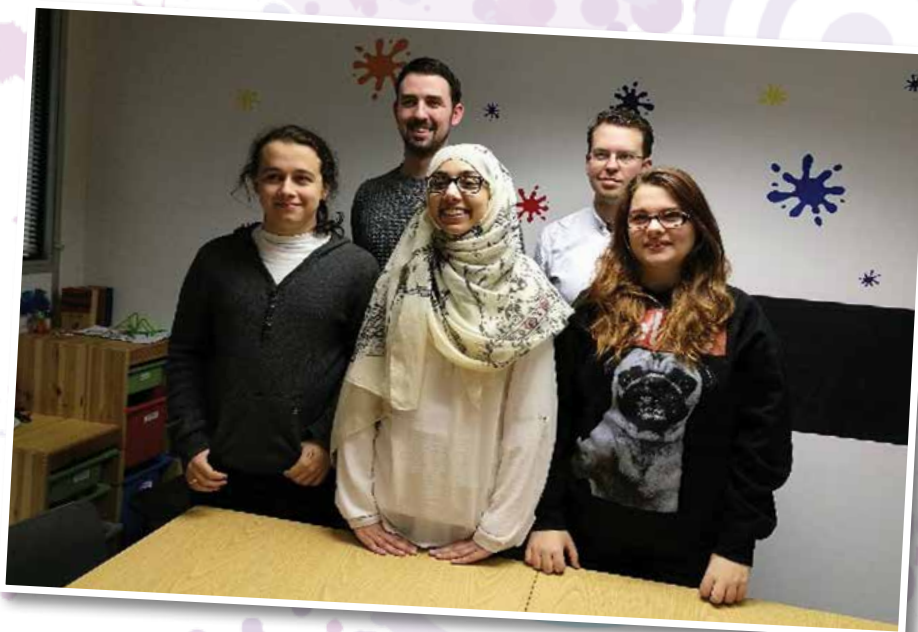
YAC Steering Group

YACs were also able to benefit from the knowledge and expertise of staff from GM Financial in Wycombe who recently took the time to deliver two training sessions on CV writing, Interview Skills and Financial Capabilities. The Life Skills sessions continue this year, focusing on emotional wellbeing, covering topics such as mindfulness, sleep and stress management. We will also continue to meet for the regular YAC socials.