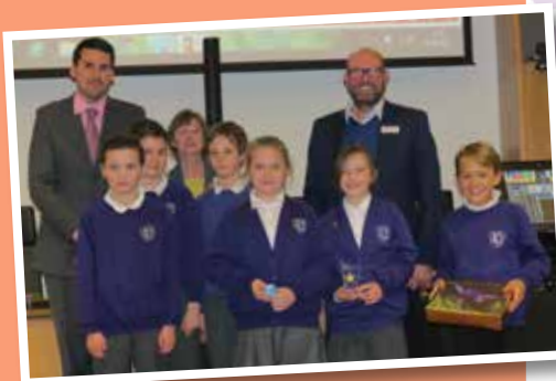
Young carers group from Swanbourne CE School receiving their Gold Award

The schools who received a Gold Award, all run young carers groups at their school, and includes Swanbourne CE, Brookmead, Buckingham Primary, Great Horwood, North Marston, St Edwards, Wingrave and Winslow school.